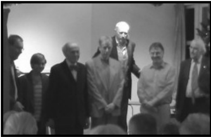
Everyone says Goodbye.